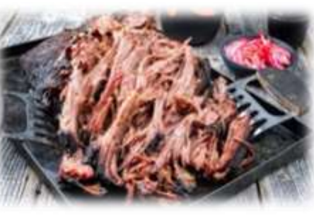
April 3<sup>rd</sup> Smoked Pulled Pork BBQ Chicken Mac & Cheese Potato Salad Caesar Salad Cowboy Beans Bread Dessert