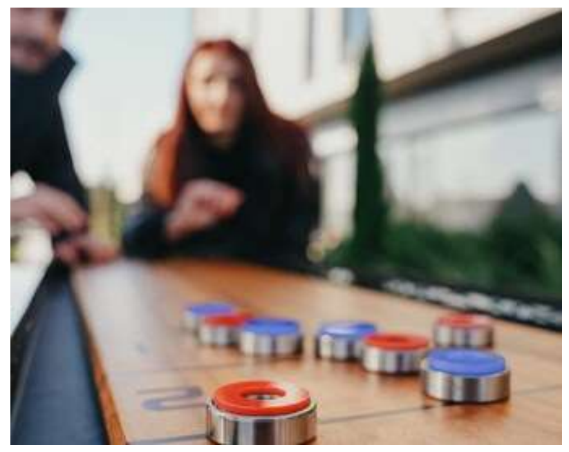
Got nothing to do on a Friday night? Try your hand at shuffleboard in the bar!

Check-in is 6:15 p.m. in the cardroom. Games start at 6:30 p.m.