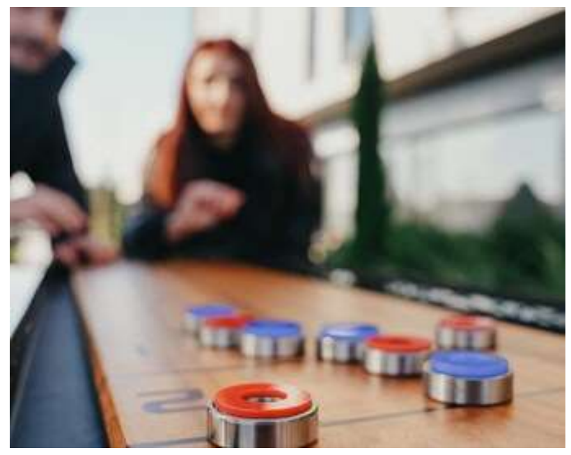
Got nothing to do on a Friday night? Try your hand at shuffleboard in the bar!

Check-in is 6:15 p.m. in the cardroom. Games start at 6:30 p.m.