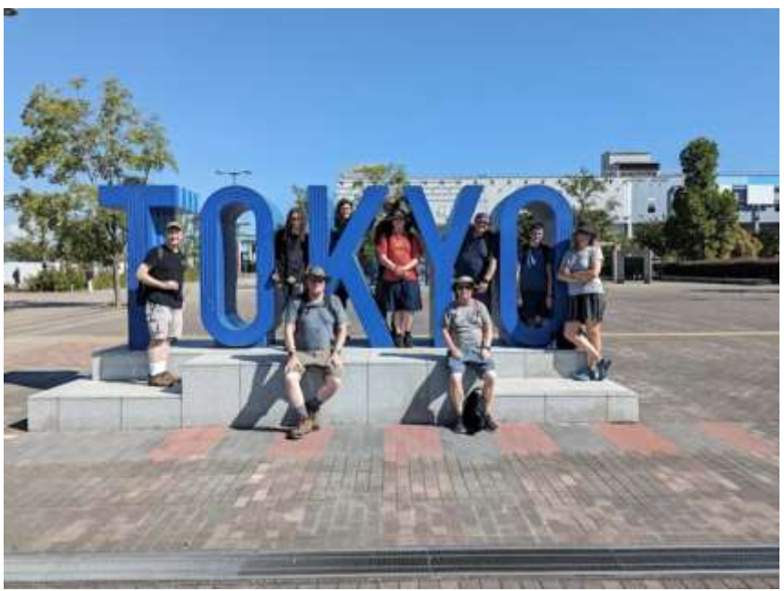
A couple of snapshots from the Tokyo summer trip.