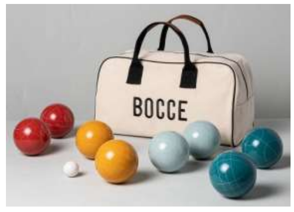
Bocce season is on a roll!