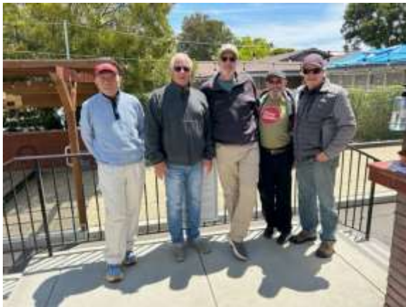
Pictured in the center is Team Genoa who won the league title. They won 13 out of a possible 16 wins this year. Great season