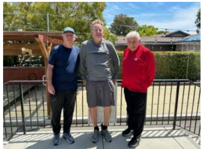
Team Roma is shown above. They finished the regular season in 4th place but ended up winning the Playoff Tournament this year.