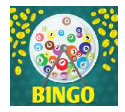
We need volunteers! Contact the lodge Secretary to volunteer.