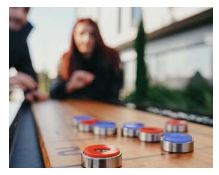
Got nothing to do on a Friday night? Try your hand at shuffleboard in the bar!